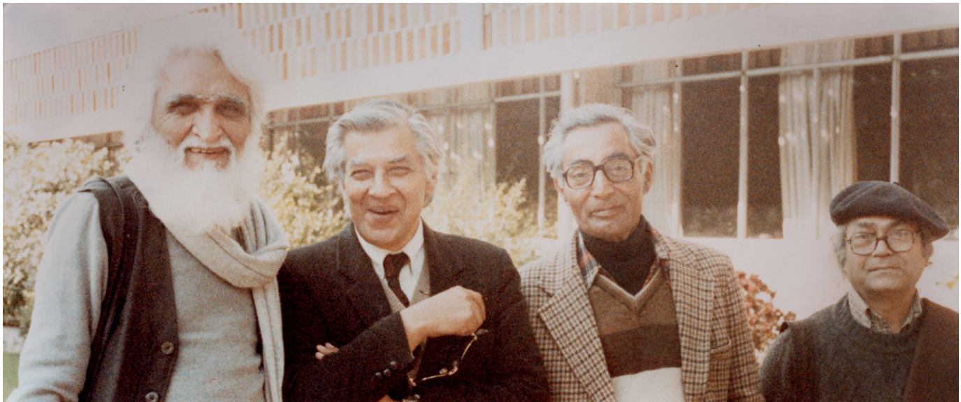
(left to right) M. F. Husain, Krishen Khanna, Ram Kumar, and V. S. Gaitonde

Jehangir Art Gallery, Bombay, 17 Indian Painters .